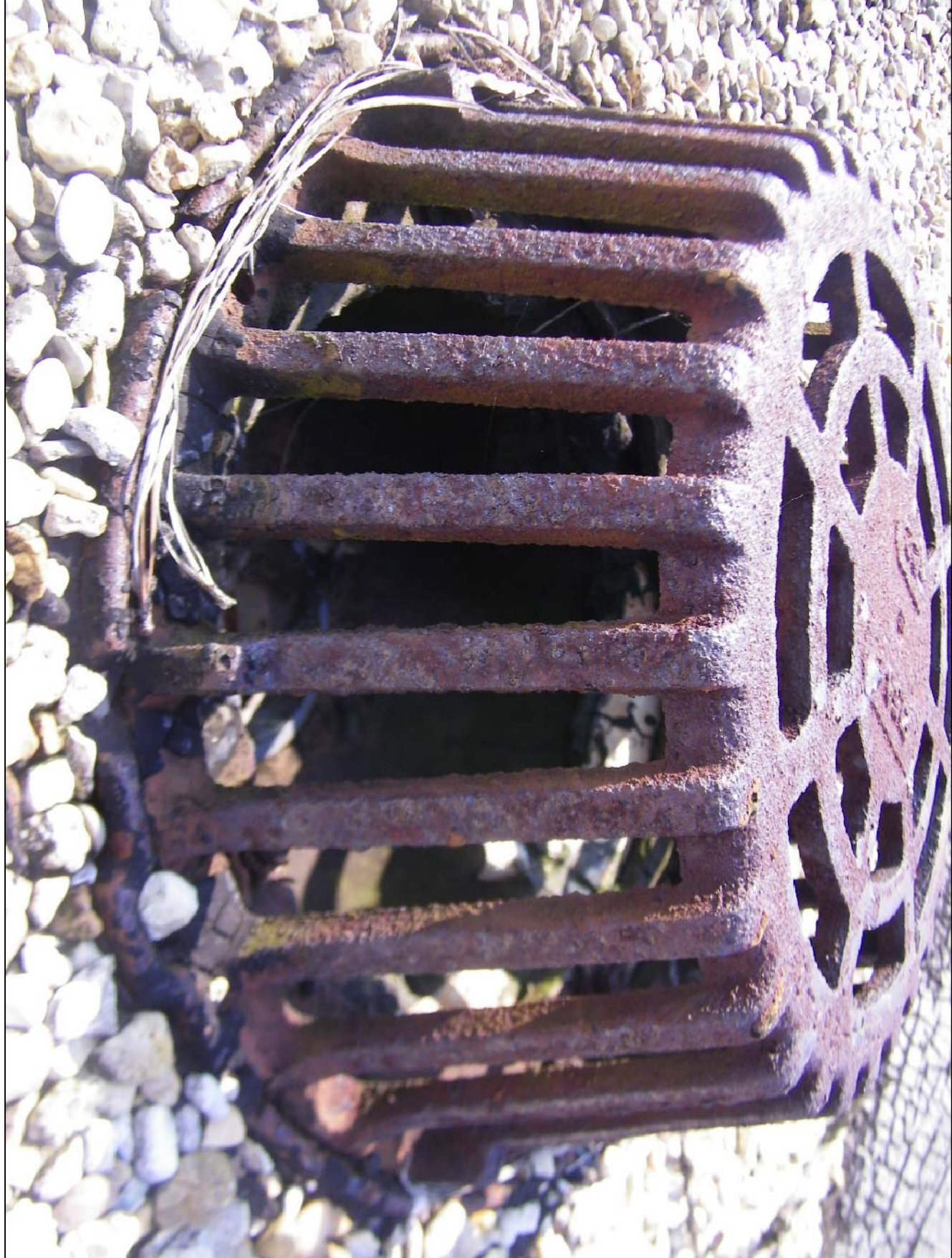
EXISTING BLDG. A (#1966) ROOF PHOTOS N.T.S.